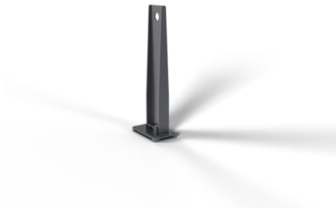
Prospect Folding Bollard - Charcoal