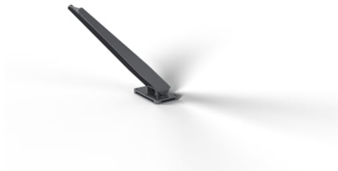
Prospect Folding Bollard - Charcoal