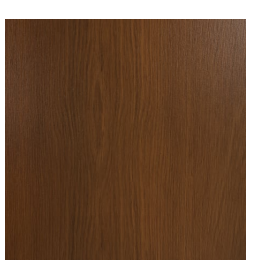
Hardwood Australian Eucalyptus Dark Oil