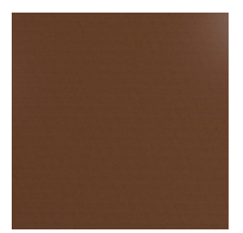
Core Powder-Coat Coreten Textured