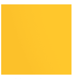
Bold Powder-Coat Zinc Yellow Satin