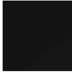
Core Powder-coat Black Satin