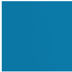
Bold Powder-coat Sky Blue Satin