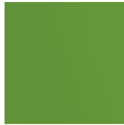
Bold Powder-coat Yellow Green Satin