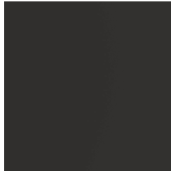
Core Powder-Coat Charcoal Satin