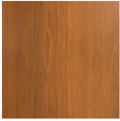
Hardwood Australian Eucalyptus Light Oil