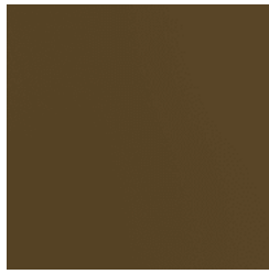
Core Powder-coat Bronze Satin Metallic