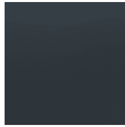
Signature Powder-Coat Deep Ocean Satin