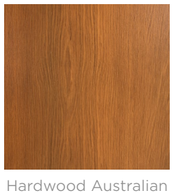
Hardwood Australian Eucalyptus Light Oil