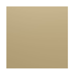
Signature Powder-Coat Paperbark Satin