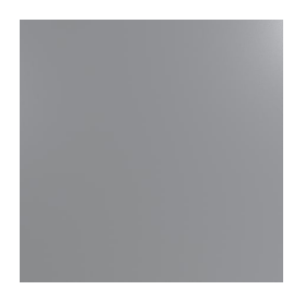
Core Powder-coat Silver Pearl Satin Metallic