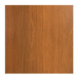
Hardwood Australian Eucalyptus Light Oil