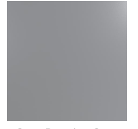
Core Powder-Coat Silver Pearl Satin Metallic