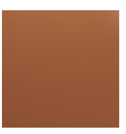
Signature Powder-Coat Claypot Satin