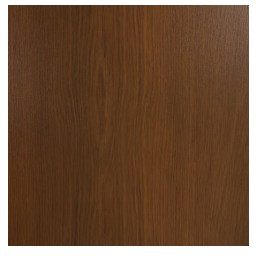
Hardwood Australian Eucalyptus Dark Oil